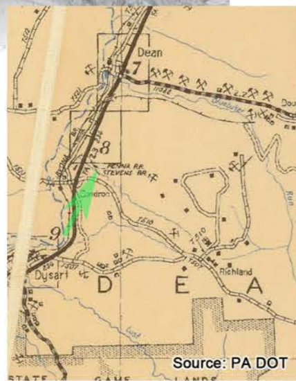
Historical Maps Used to Confirm Existence & Location of P.R.R.