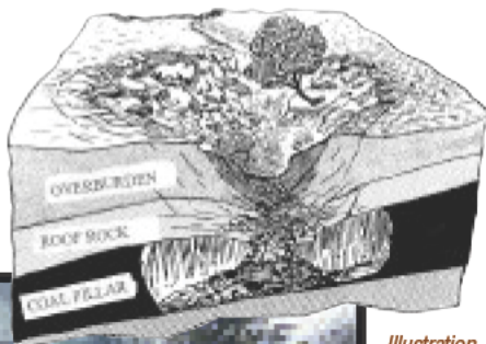
Illustration of Sinkhole Subsidence.

Sinkhole subsidence occurs in areas overlying underground mines which are relatively close to the ground surface. This type of subsidence is fairly localized in extent and is usually recognized by an abrupt depression evident at the ground surface as overburden material collapses into the mine void. Sinkhole subsidence is perhaps the most common type of mine subsidence and has been responsible for extensive damage to many structures throughout the years.