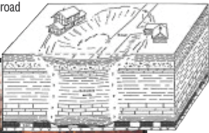
Illustration of Trough Subsidence.

Subsidence troughs over abandoned mines usually occur when the overburden sags downward due to the failure of remnant mine pillars or by punching of the pillars into a soft mine roof or floor. The resultant surface effect is a large, shallow yet broad depression in the ground which is usually elliptical or circular in shape.